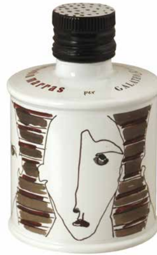
Balsamic Vinegar of Modena