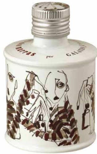
Extra Virgin Olive Oil Taggiasca Quality