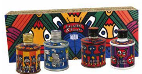
4 Gift Boxes