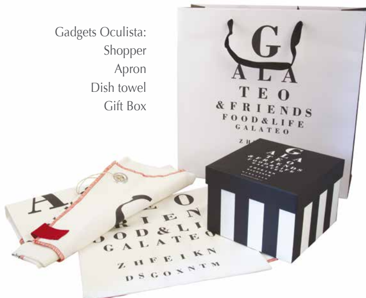
Gadgets Oculista: Shopper Apron Dish towel Gift Box