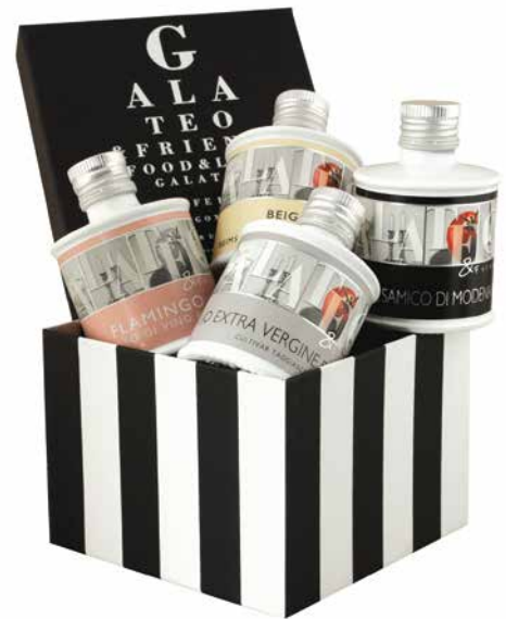
Oculista Gift Box