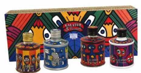
4 Gift Boxes