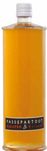
Apple Condiment 1L