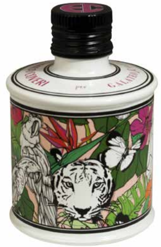
Chianti Wine Vinegar