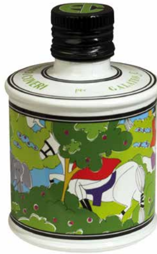
Condiment with Extra Virgin Olive Oil and Basil