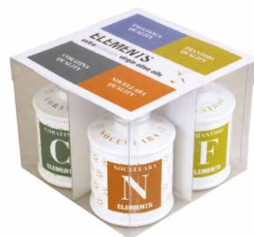
Transparent box for four bottles of 0,25 L

Matches: seed raw on vegetables, salads and oil dip, baking fish and on Mediterranean dishes.