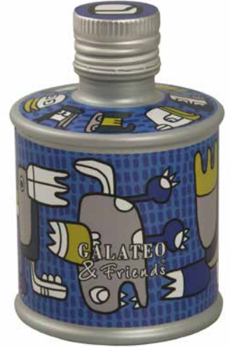
Extra Virgin Olive Oil Taggiasca Quality