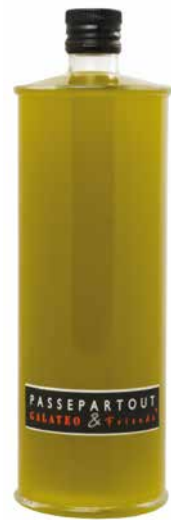
Lemon Condiment 1L (E.V.O. Oil and Fresh Lemon)