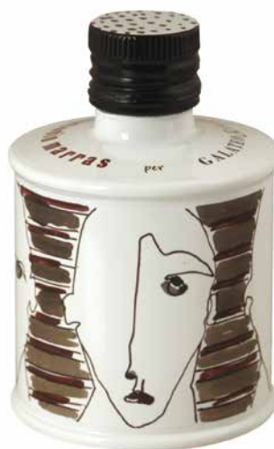
Balsamic Vinegar of Modena