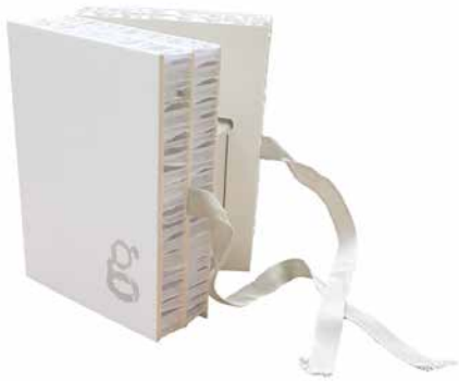
Box for a single bottle of 0,25 L