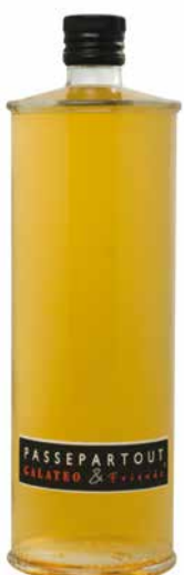
Wine Vinegar 1L "REIME CHAMPAGNE - ARDENNE"