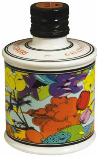
Extra Virgin Olive Oil Taggiasca Quality