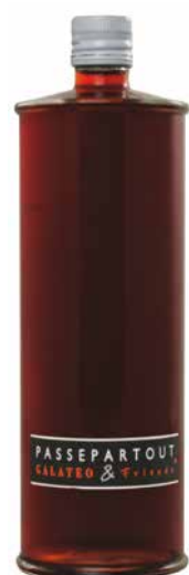
Barolo Wine Vinegar 1L