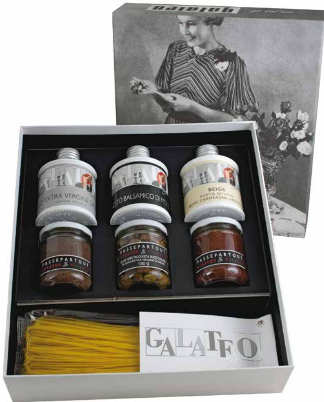
un po' di Galateo Gift Box