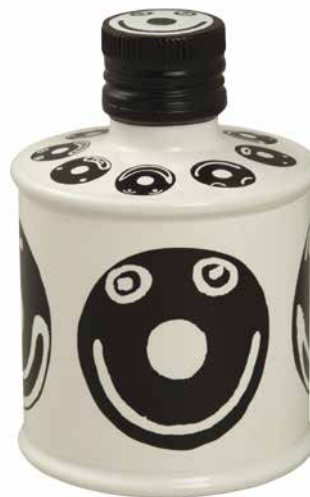
10 Corso Como