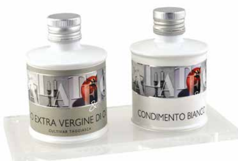
Bottle holder in plexiglass