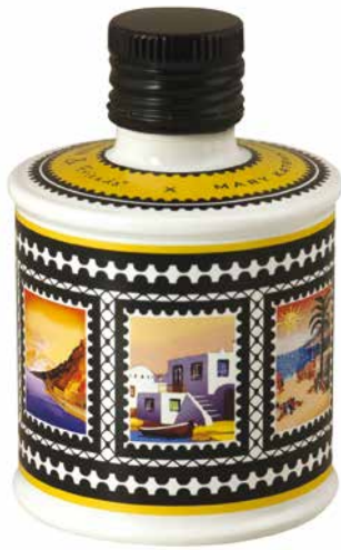
Extra Virgin Olive Oil Taggiasca Quality