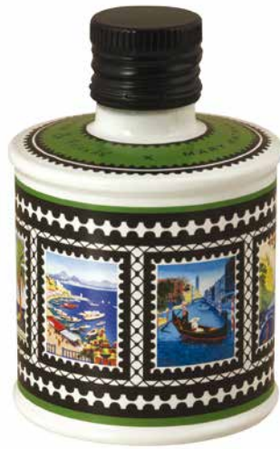
Balsamic Vinegar of Modena