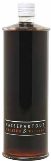
Pomegranate Condiment 1L