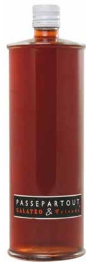
Aged Red Wine Vinegar 1L