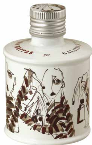
Extra Virgin Olive Oil Taggiasca Quality