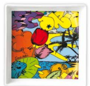
Porcelain dipping dishes