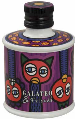
Balsamic Vinegar of Modena