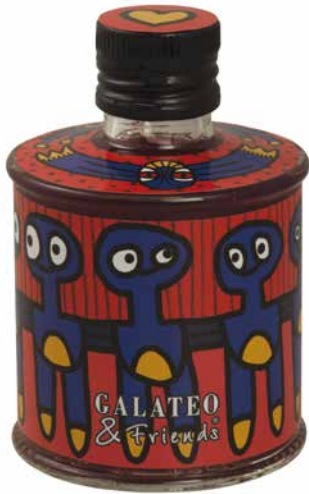
Red Wine Vinegar