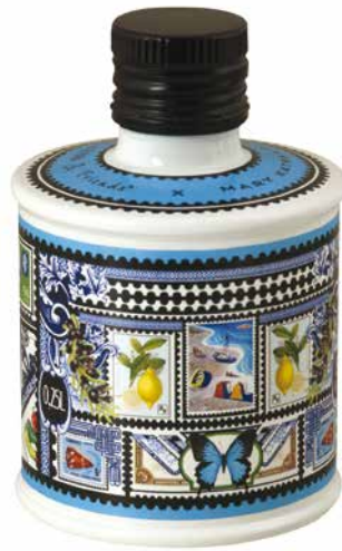
Condiment with Extra Virgin Olive Oil and Fresh Lemon