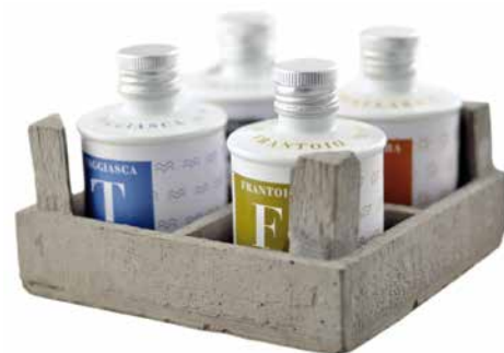
Cement support for four bottles of 0,25 L