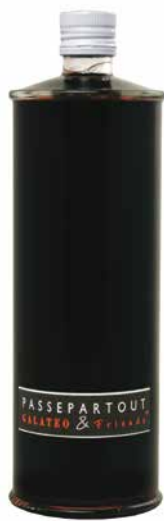
Balsamic Vinegar of Modena 1L