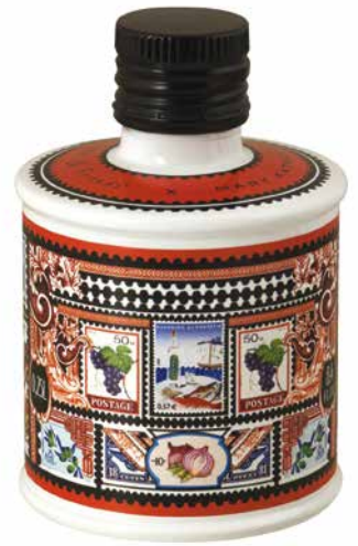
Rosé Wine Vinegar