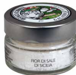
Fior di sale from Sicilia