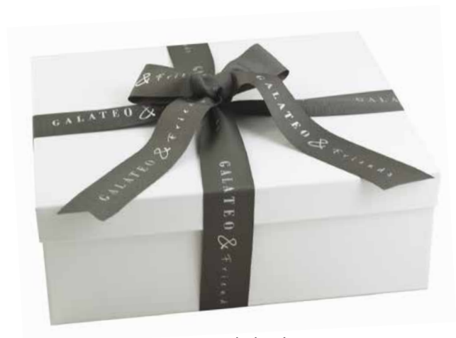
Untitled Gift Box