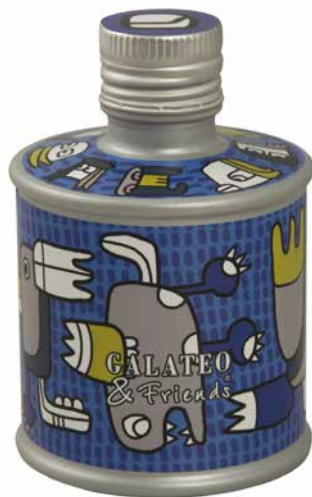
Carlo Volpi - Public Code