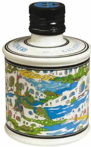
Condiment with Extra Virgin Olive Oil and Chilli