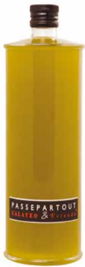
Extra Virgin Olive Oil 1L