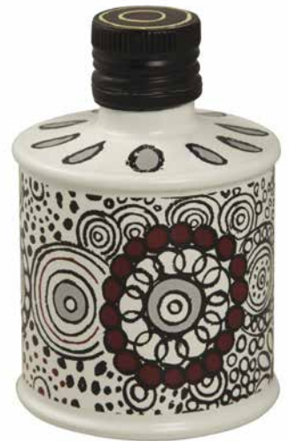
10 Corso Como