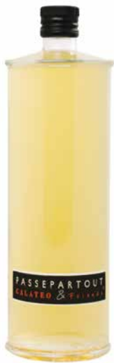
White Balsamic Condiment 1L