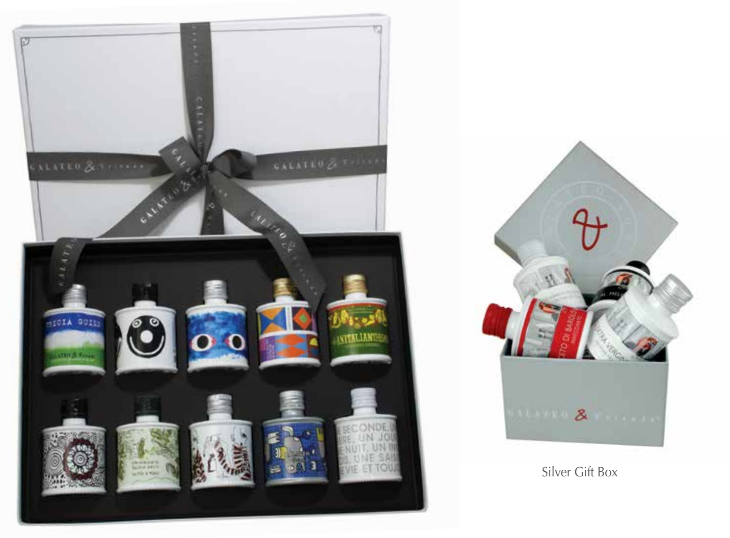
Signatures Gift Box