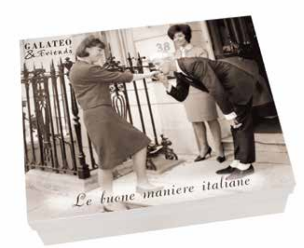
Baciamano Gift Box