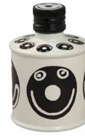
Extra Virgin Olive Oil Taggiasca Quality