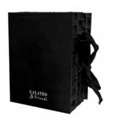
Box for a single bottle of 0,25 L