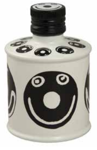
10 Corso Como