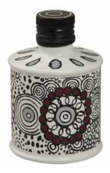
10 Corso Como