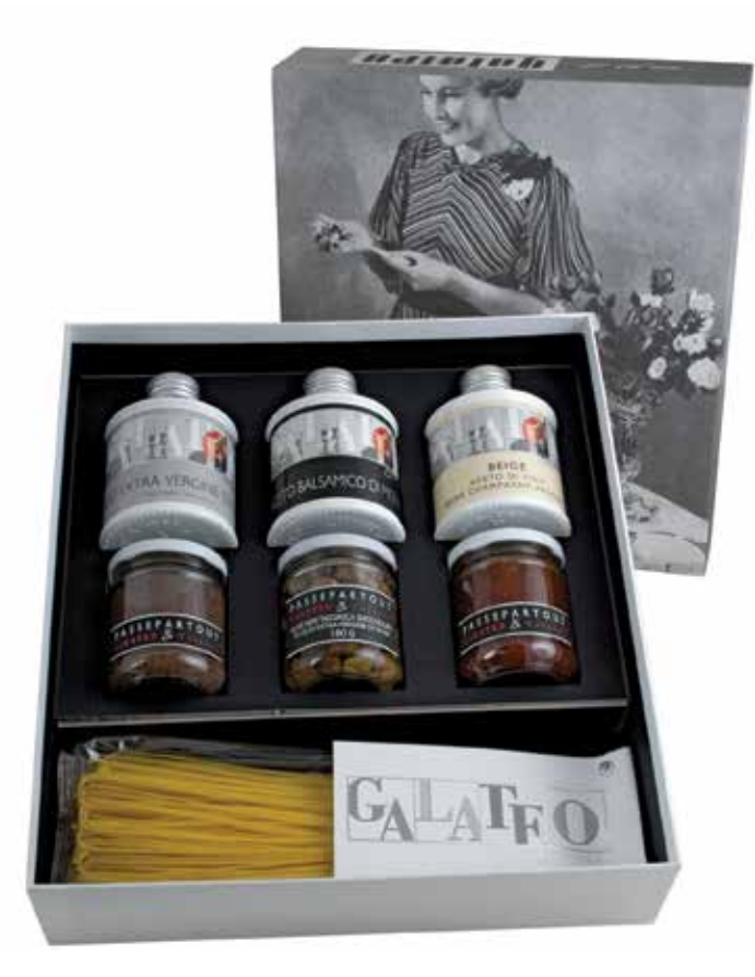
un po' di Galateo Gift Box