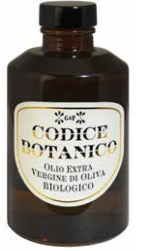
Extra Virgin Olive Oil Organic