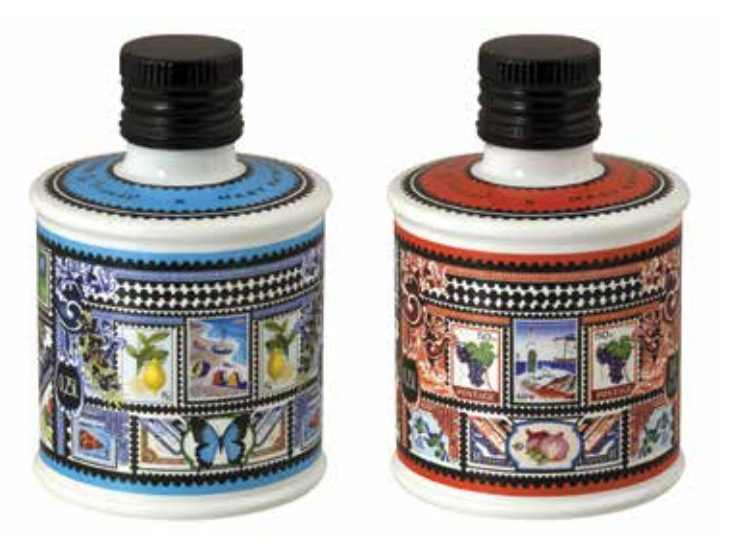
Condiment with Extra Virgin Olive Oil and Fresh Lemon