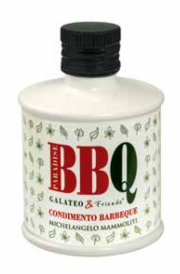
BBQ PARADISE Condiment based on Extra Virgin Olive Oil, Spices and Herbs