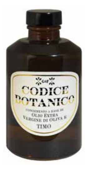
Condiment with Extra Virgin Olive Oil and Thyme